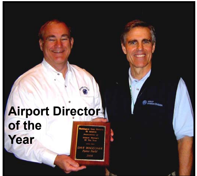
Airport Director of the Year