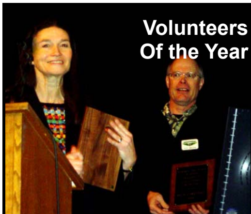
Volunteers Of the Year