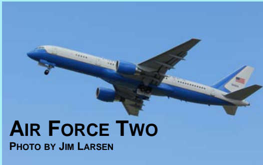
AIR FORCE TWO PHOTO BY JIM LARSEN