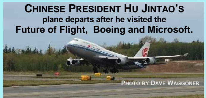
CHINESE PRESIDENT HU JINTAO'S plane departs after he visited the Future of Flight, Boeing and Microsoft.