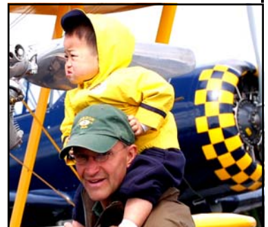
Kids of all ages enjoyed the wonderful displays of all kinds of aircraft.