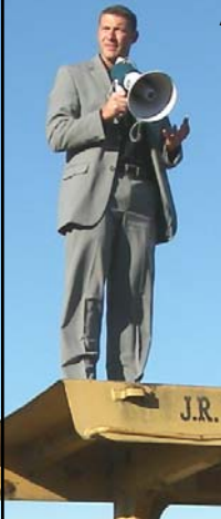
County Executive Aaron Reardon

Airport has purchased an asphalt crack sealer for ongoing pavement maintenance to preserve and extend the life of the airport pavement. This phase of the asphalt maintenance includes joint and crack repair. The runways and taxiways have taken priority with 34L/16R nearing completion. Maintenance will be expanding its sealing efforts into the hangar and ramp areas as long as dry weather permits. Maintenance would like to thank our Airport tenants for their patience as we continue these projects.