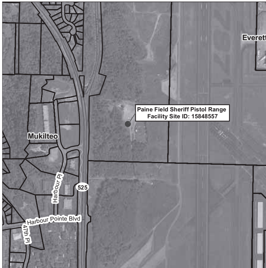
Paine Field Sheriff Pistol Range Site Map 3220 100 th Ave SW, Everett, Washington