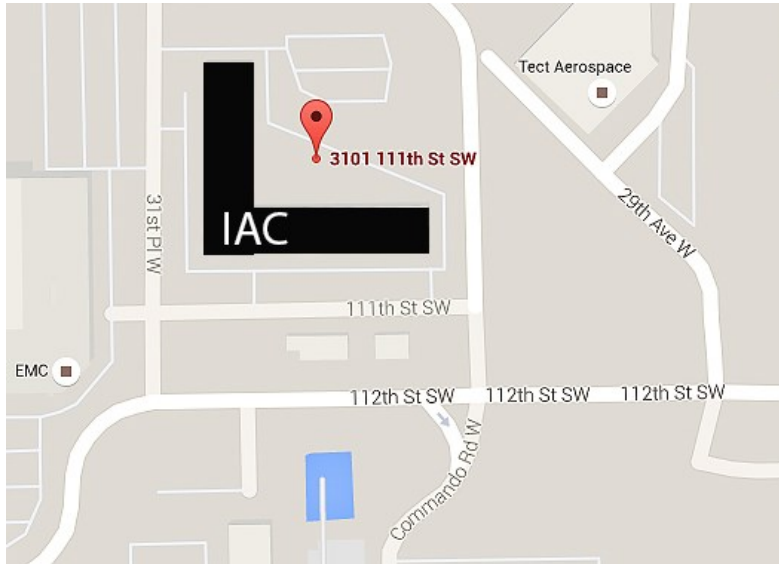
BUILDING LOCATION MAP